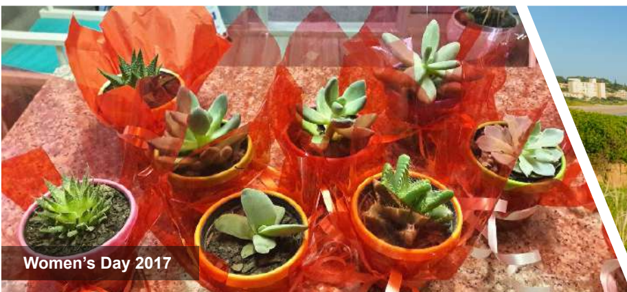
Women's Day 2017

Please refer to the 2018 calendar available on the following link: www.kridzil.co.za/docs/KridzilWoonstelleCalendar2018.pdf